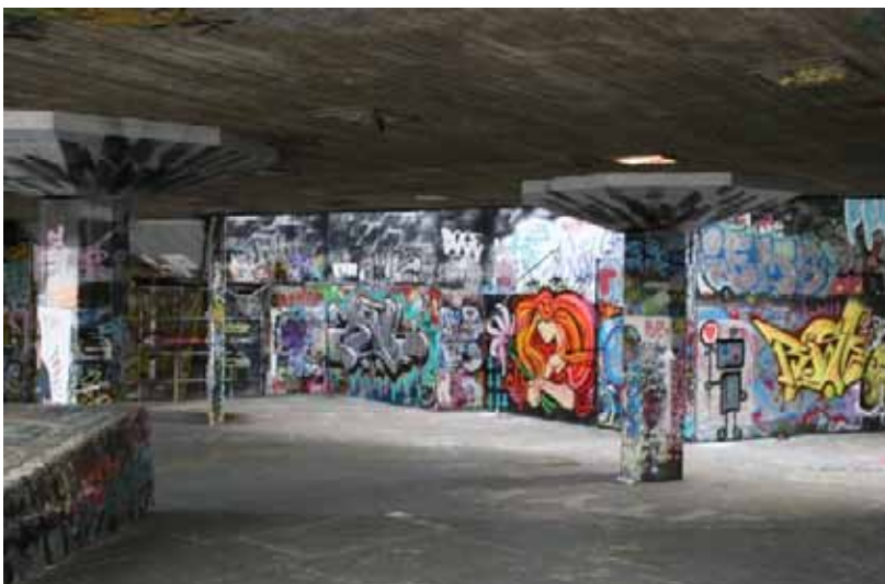
The skate park under Queen Elizabeth Hall

This walk explores how the south side of the Thames has been regenerated since the Second World War. Derelict industrial sites and depressed neighbourhoods have been replaced with iconic buildings, office blocks, apartments and new cultural attractions.