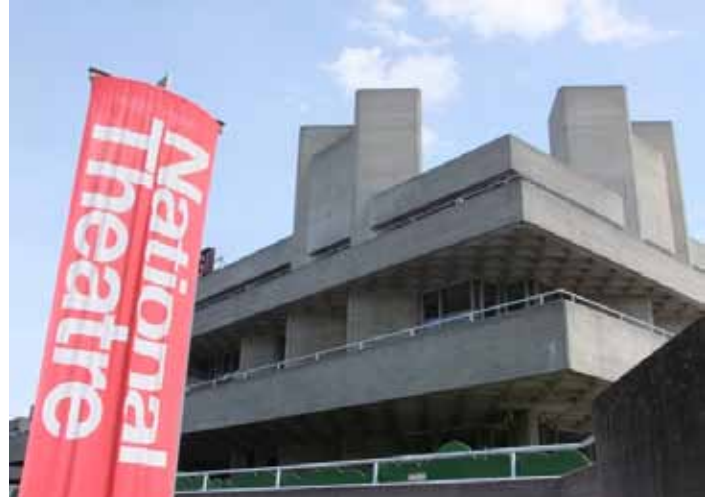
The Royal National Theatre

This stretch of the River Thames, known as the South Bank and Bankside, is now one of the most popular visitor areas of London. Each year an estimated 22 million people from around the world enjoy its sights and attractions.